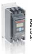
PSE142 ... PSE170