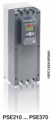
PSE210 ... PSE370