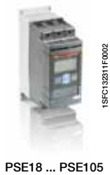
PSE18 ... PSE105